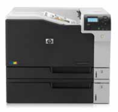
HP Color LaserJet Enterprise M750n

Mobile printing capability:10 HP ePrint, Apple AirPrint™